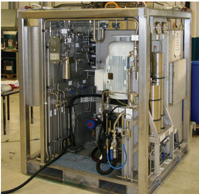
Test & Flush HPU