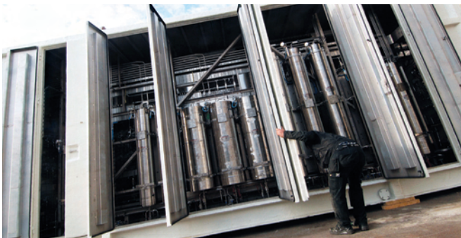
HPU for Topside application