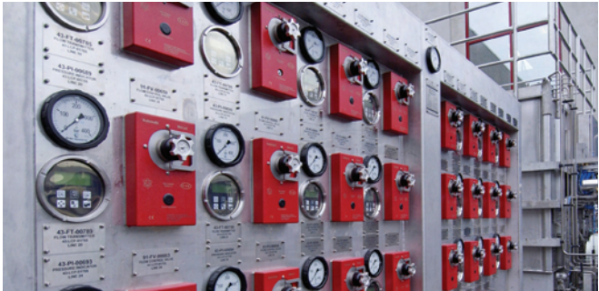
Chemical Distribution Panels