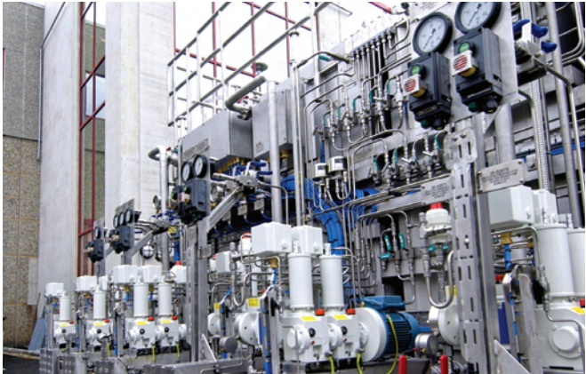
Chemical Injection Pump Skid